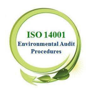
Environmental Audit course