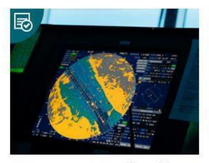
ECDIS Company-Specific Training