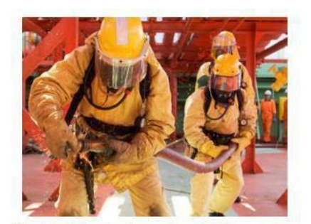
Fire Fighting Equipment and Maintenance