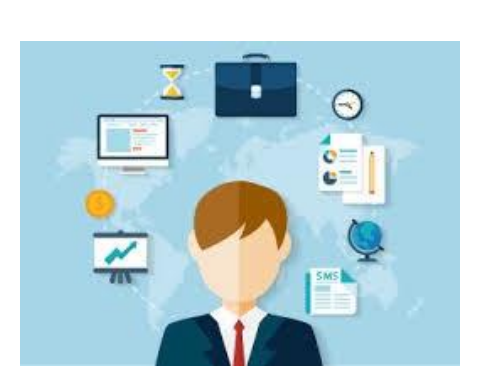
DPA training course