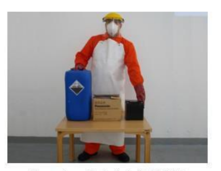
Hazardous Materials (HAZMAT)