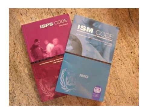
ISM Auditor course