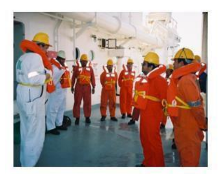
Marine Safety for Non-Seafarers