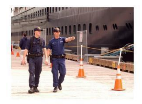
STCW Security Awareness