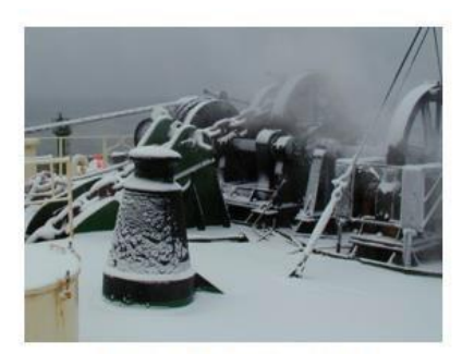
Cold Weather Operations