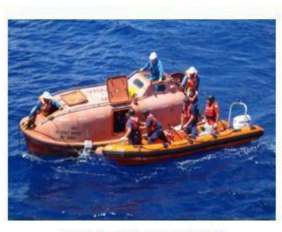
Search and Rescue (SAR)