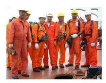
Maritime Labour Convention 2006 (MLC)