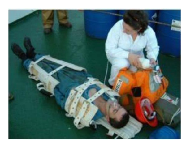
Slips, Trips and Falls