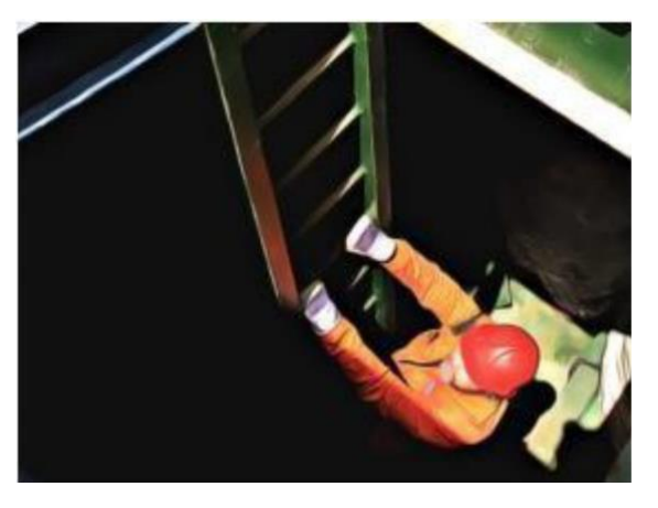
an introduction to Risk Assessment