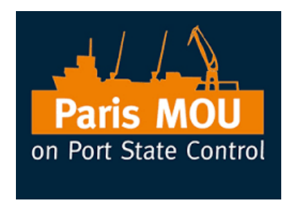
Port State Control course