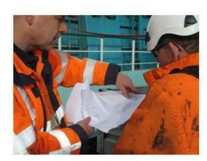
Tank Cleaning for Oil Tankers