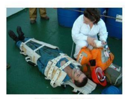
Slips, Trips and Falls