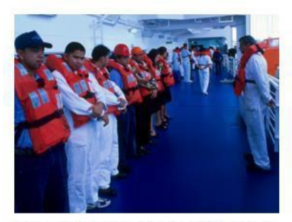
Roles and Responsibilities of the Safety Officer