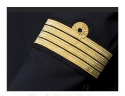
Master's Weekly Checks