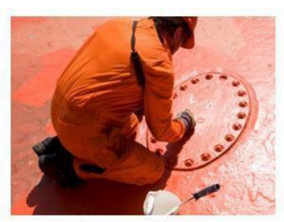
Painting and Surfaces