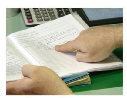
Environmental Record Keeping