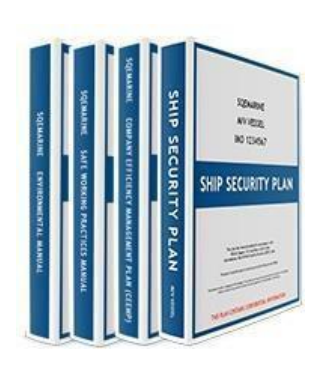
Ship security assessment course