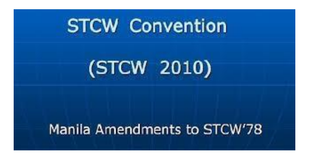
STCW convention course