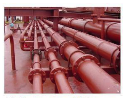
Pipeline Inspection and Maintenance