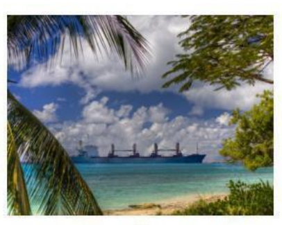
Crew Health and Welfare in Tropical Climates